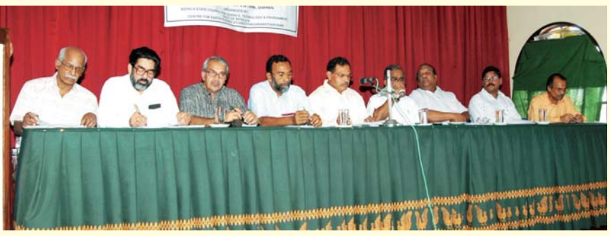
Panel discussion in progress

CESS organised a two day brainstorming workshop sponsored by KSCSTE at Kochi during 19-20 September 2005 to discuss the recommendations of the Carrying Capacity Study of Greater Kochi Region carried out by CESS, CWRDM, KFRI, KSSP, KSPCB and CUSAT under the coordination of NEERI to examine how the suggestions from the study can be used for preparing appropriate intervention plans for the Kochi region. Stakeholders including